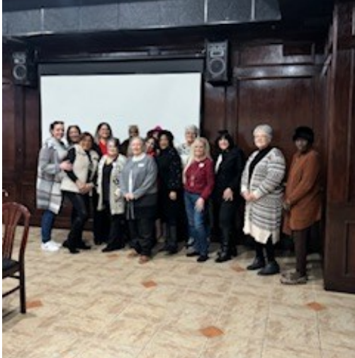
Our first meeting of 2024: We started off with a bang!