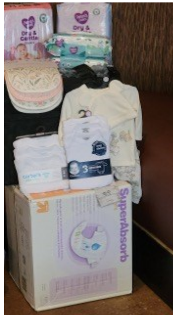
Our Welfare Chairman contacted a local organization Blessed Beginnings and organized donation from the chapter to full some of their needs.