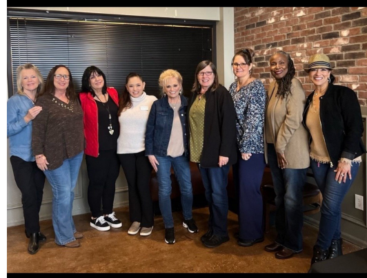
Our February meeting: We Love NARBW