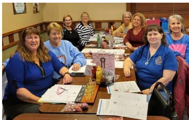
Founders Day Dinner

Omaha Chapter is looking forward to seeing you all in May! Can't wait to catch up with old friends, make new friends and some great memories!